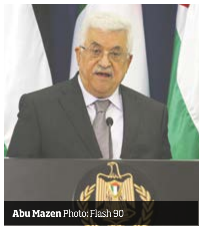
Abu Mazen

Abu Mazen is much more dangerous than Haniye and Hamas. He speaks in the language of the world and wants to destroy the State of Israel using the UN and the International Court in the Hague. Why do we try to appease him and strengthen him again and again?