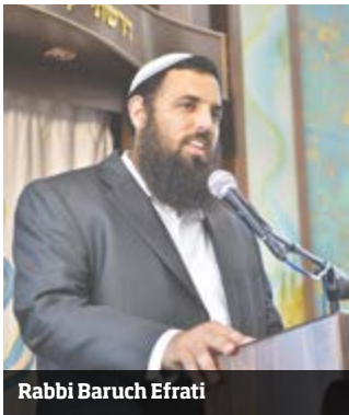
Rabbi Baruch Efrati

"First of all we must stop using the terms that they have invented. There is no such thing as Palestinians; there is no such thing as a Palestinian people and there is no Palestinian history here. These are refugees who came here within the past decades. Whenever the People of Israel is confused about its identity, the Almighty sends us enemies to sharpen our sense