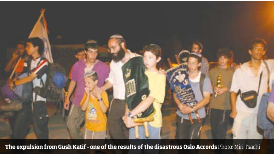
The expulsion from Gush Katif - one of the results of the disastrous Oslo Accords