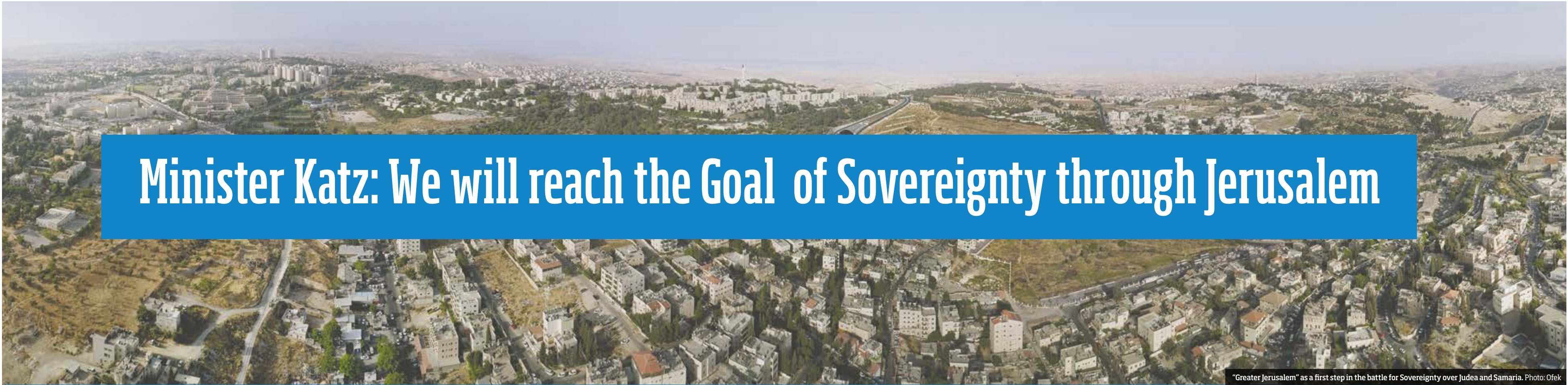
“Greater Jerusalem” as a first step in the battle for Sovereignty over Judea and Samaria.

He is defined as the government’s bulldozer and, along with the changes in traffic patterns that he causes in Israel’s roads, he also promotes the establishment of ‘Greater Jerusalem’, which will include Gush Etzion, Ma’ale Adumim and more. In his view, it will be difficult to find opposition to this plan, and afterwards, the map will look entirely different. An interview with Minister Yisrael Katz.