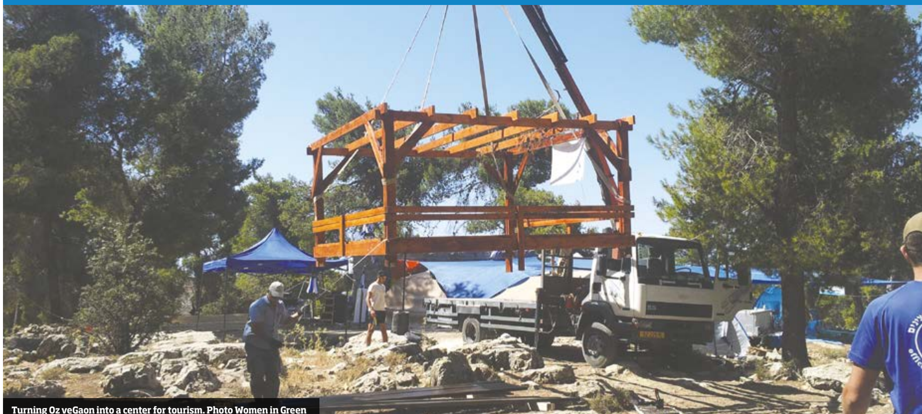
Turning Oz veGaon into a center for tourism.

In the beginning of the month of Tammuz (July), members from the Women in Green movement planted yet another stake in the Land, as they have done many times in recent years. Following the establishment of Netzer, Shdema and other sites, the movement established a tourist site, Oz veGa'on, on the hill above the Gush Etzion Junction.